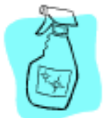
Paper, Logs, Bleach